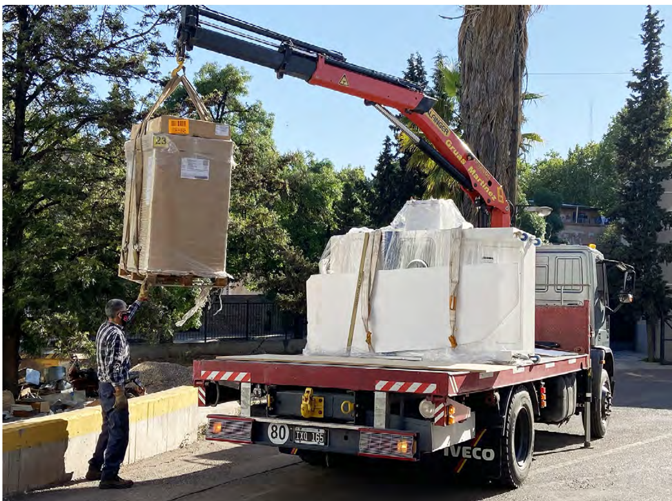
FIG. 3. The Agency dispatched equipment to countries around the world to enable them to use real-time reverse transcription–polymerase chain reaction, a nuclear derived technique, to rapidly detect the coronavirus that causes COVID-19. Here, equipment donated by the Agency is delivered to the Nuclear Medicine School Foundation (FUESMEN) in Mendoza, Argentina.

The Co-operative Agreement for Arab States in Asia for Research, Development and Training related to Nuclear Science and Technology (ARASIA) named five new resource centres in secondary standards dosimetry, expanding the ARASIA resource centres in human health and enhancing access across the region to science and technology for development.