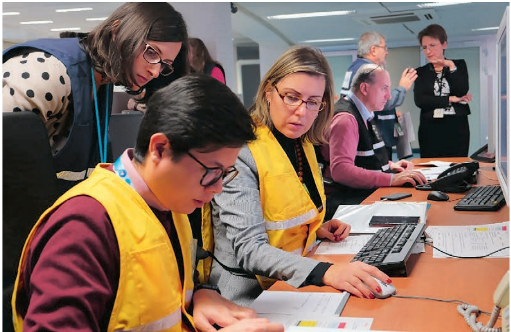
FIG. 3. Agency staff participate in a full response exercise at the Incident and Emergency Centre in Vienna.