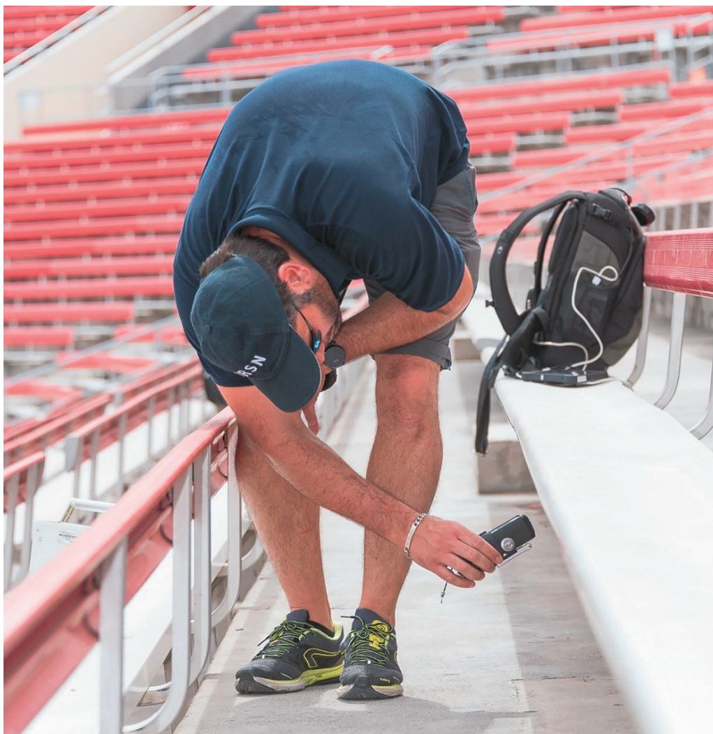
FIG. 1. A member of the RANET Joint Assistance Team ‘sweeps’ a stadium in Las Vegas (United States of America) to detect any hidden radioactive sources before a simulated major sport event.