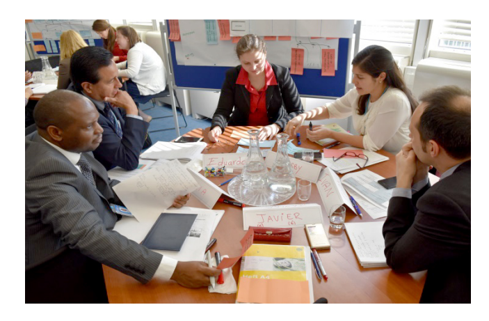
FIG. 3. Participants in a workshop on the logical framework approach, April 2016.

600 individual technical cooperation stakeholders, including project counterparts, National Liaison Officers, Programme Management Officers and Technical Officers. These events were held both in-house and in Member States, and were tailored to the specific needs of the audience. Participants were provided with instructions and support on using the logical framework approach (LFA) to design new projects (Fig. 3), as well as on using monitoring and evaluation tools for ongoing projects.