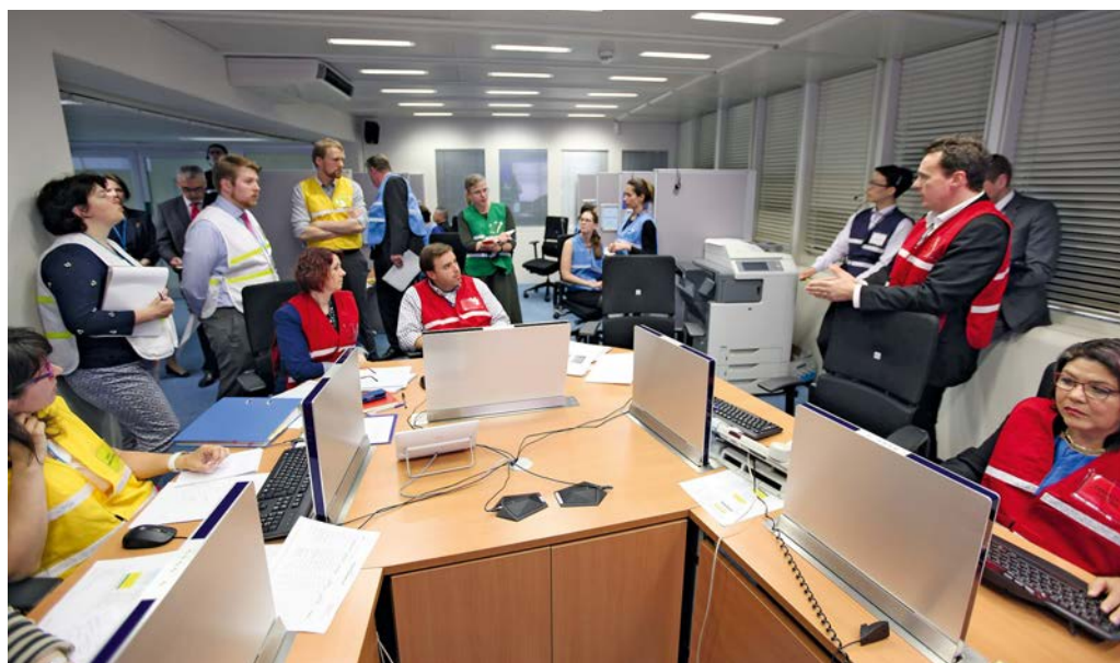
FIG. 3. Agency staff responders during an internal exercise in 2016.

The Agency organized a comprehensive programme of training, drills and exercises in 2016 to enhance the skills and knowledge of those Agency staff members who serve as qualified responders under the Incident and Emergency System (Fig. 3). The programme offered approximately 150 hours of training during the year, including 84 training classes delivered to nearly 200 Agency staff responders.