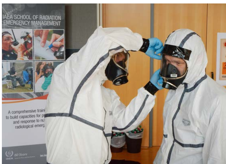
FIG. 1. Participants in the School of Radiation Emergency Management held in Traiskirchen, Austria, in October (photograph courtesy of S. Schoenhacker).

and the International Labour Organization jointly organized a webinar on protection criteria for emergency workers and helpers in a nuclear or radiological emergency. The webinar was aimed at participants from relevant authorities — including both employers and emergency workers — having responsibilities, rights and duties in relation to occupational radiation protection in a nuclear or radiological emergency. Around 110 people took part worldwide. Two new capacity building centres for EPR were designated in 2016, in Austria and the Republic of Korea.