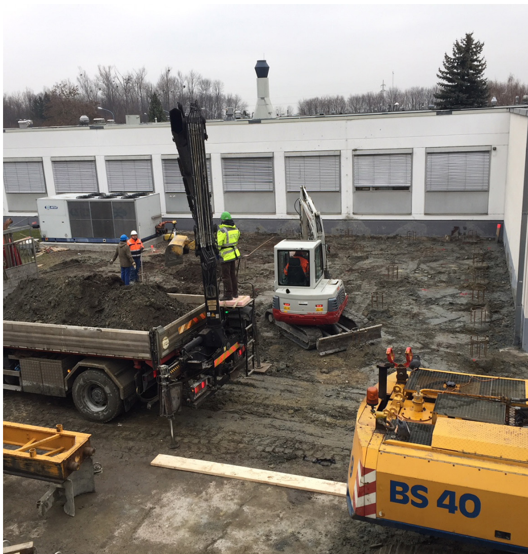
Construction of a bunker for a linear accelerator at the IAEA's campus in Seibersdorf, Austria.