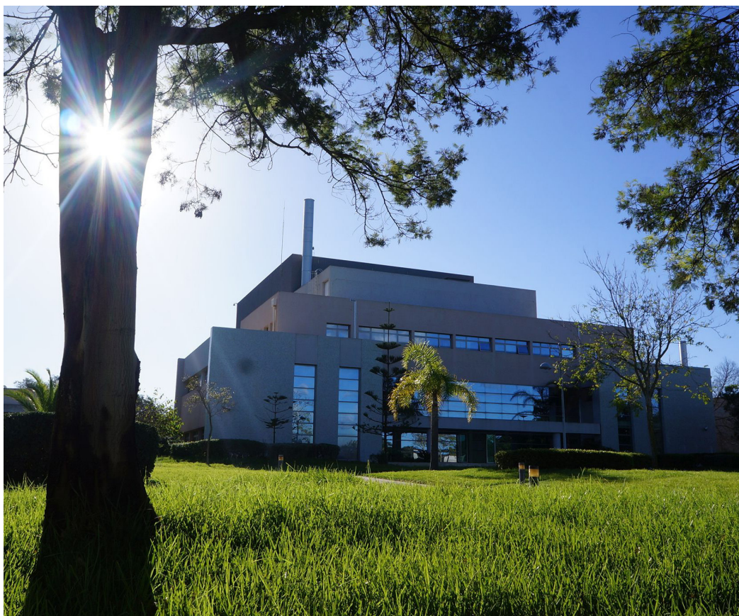
Nuclear Research Centre of Maamora, Morocco.