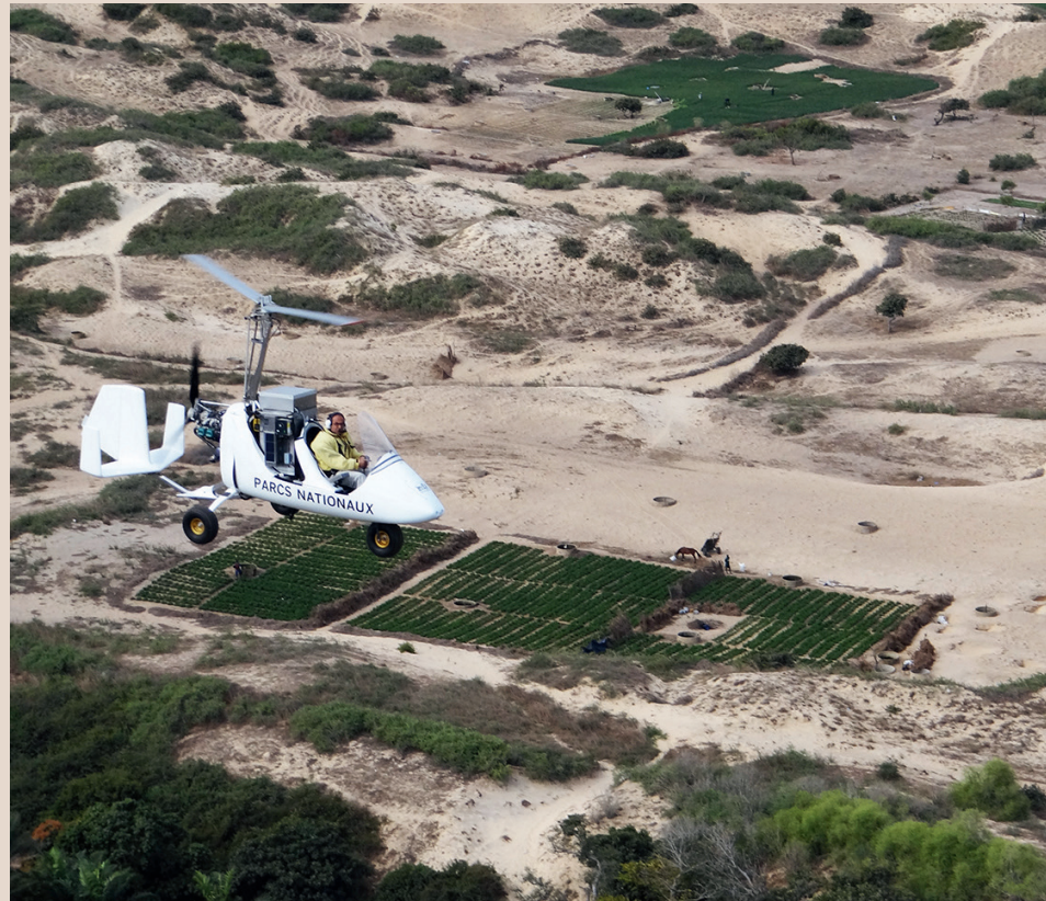
Aerial releases of sterile male tsetse flies over the Niayes using a gyrocopter.

The Joint FAO/IAEA Division supports about 40 SIT field projects delivered through the IAEA technical cooperation programme, like the one in Senegal, in different parts of Africa, Asia, Europe and Latin America. It has supported the successful eradication of the tsetse fly from the island of Unguja, Zanzibar; in Ethiopia it has reduced the fly population by 90 per cent in parts of the Southern Rift valley.