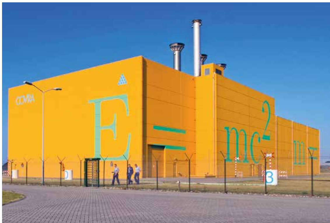
HABOG storage facility, Central Organization for Radioactive Waste (COVRA), Netherlands