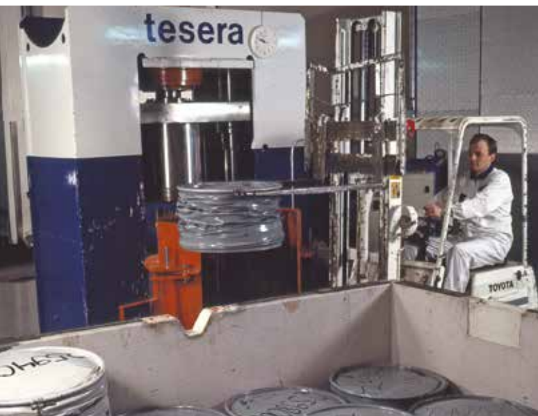
Supercompactor for solid waste drums

Pretreatment activities prepare the waste for processing and may include sorting and separating different types of waste, as well as size reduction or shredding to optimize treatment and disposal. Decontamination techniques reduce the volume of waste requiring treatment thereby minimizing the disposal costs.