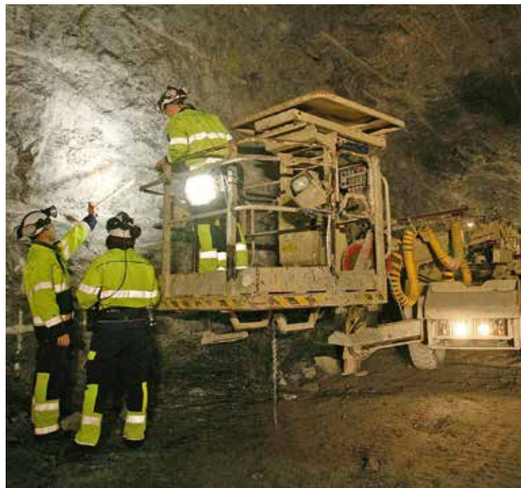
Underground exploration to demonstrate feasibility of deep geological disposal for high level waste