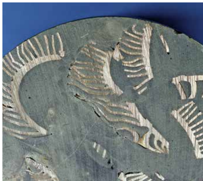
Cement-encapsulated Magnox fuel-cladding at Sellafield

Treatment activities focus on waste volume reduction, radionuclide removal from the waste, and often changing its physical and chemical composition. There are technologies to treat both liquid waste and solid waste.