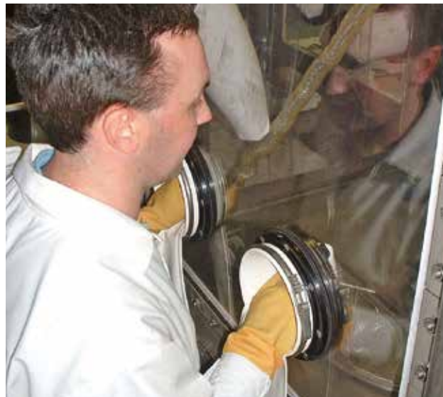
Sorting box for waste segregation

Characterization is a technique that provides information on the physical, chemical and radiological properties of the waste in order to identify appropriate safety requirements and potential treatment options, and to ensure compliance with accepted storage and disposal criteria. X-ray and other tomographic methods are also used to confirm the presence of or look for hazardous materials or prohibited items.