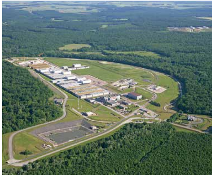
Low level waste disposal at the Centre de l'Aube facility

All waste storage facilities are required to have a regime to monitor the integrity of waste packaging to ensure the safety and protection of the environment.