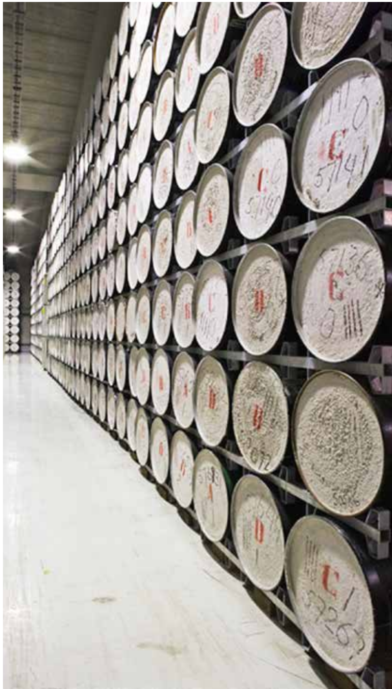
Long term storage facility for low level waste