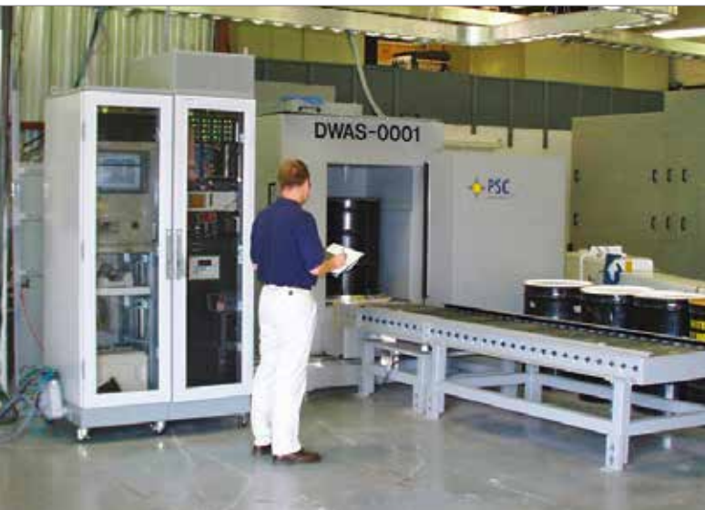
Passive Active Neutron Differential Die-Away System (PANDDA™), a drum-monitoring high resolution gamma spectroscopy system