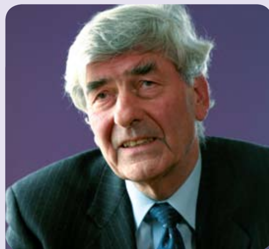
Ruud Lubbers, former Prime Minister of the Netherlands, chaired the 11th IAEA Scientific Forum held from 30 September-1 October 2008 in Vienna, Austria.

In the Middle East, there have been talks of establishing a nuclear weapons free zone. For this to happen, you need a supranational agency in charge of