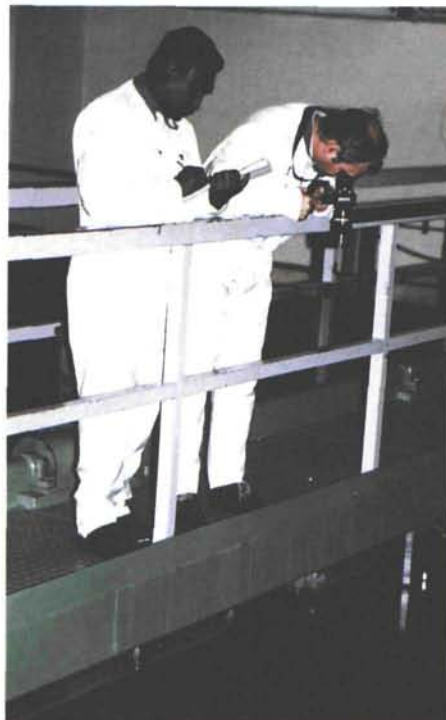
Scenes from IAEA safeguards and verification activities (clockwise from top left): Examining seals at IAEA headquarters through the use of laser disk recording; preparing for fuel measurements at the damaged research reactor at Tuwaitha in Iraq; inspectors using a special viewing device to verify irradiated fuel in storage ponds; taking environmental samples during field trials in Sweden; visiting a reactor in the Democratic People's Republic of Korea (DPRK); and rendering harmless the Kalahari test shafts associated with the terminated nuclear-weapon programme in South Africa.