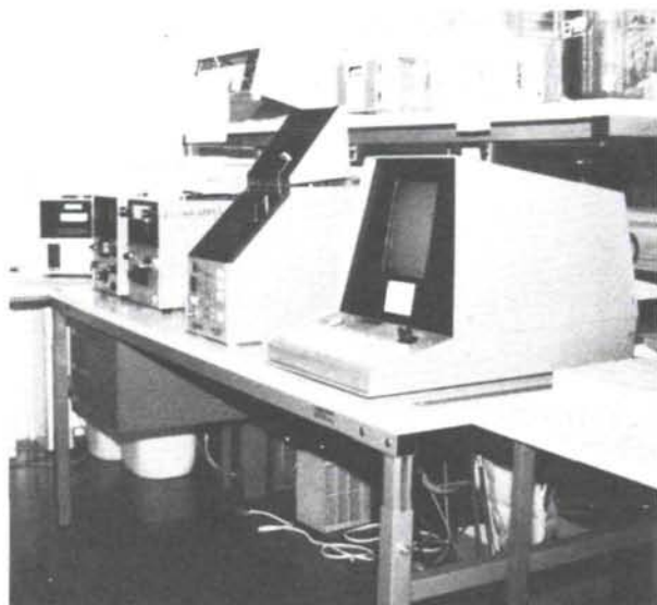
At its headquarters in Vienna, the IAEA maintains a laboratory for personnel dosimetry services.

the hands of national authorities, and IAEA staff can assist in preparing the syllabus and providing outside lecturers. In some countries without an adequate infrastructure for radiation protection, training activities may be organized within the framework of a technical assistance project.