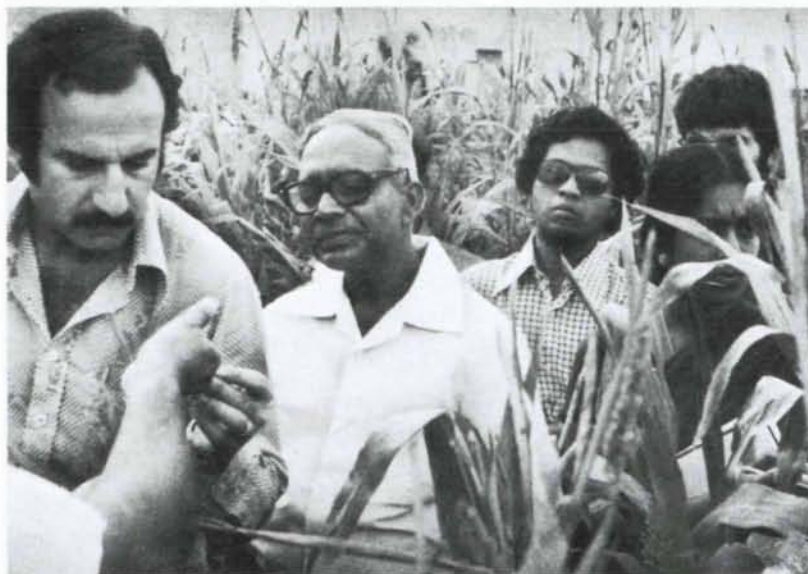
Scene from 1977 training course in India sponsored by the IAEA, FAO, and Swedish International Development Agency, where mutation breeding of sorghum with improved disease resistance drew keen interest.

Fertilizers labelled with the stable isotope nitrogen-15 were used to demonstrate that deep placement (5-15 centimeters) of nitrogen fertilizers in soil gives higher