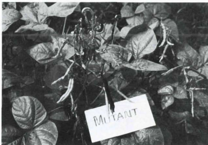
An essential source of protein in diets of millions of people, pulses have been a focus of the Agency's plant breeding programmes for 30 years. About 80 improved cultivars of 13 different species derived from radiation-induced mutations have been given to farmers for improved food supplies.

uptake efficiencies than surface applications. The data from 13 developing countries showed an increase of about 32% in nitrogen uptake efficiency by plants when the fertilizer was placed at this depth, compared to surface application. One participating country which followed fertilizer recommendations based on these results reported that US $30 million were saved in one year from reduced nitrogen fertilizer applications.