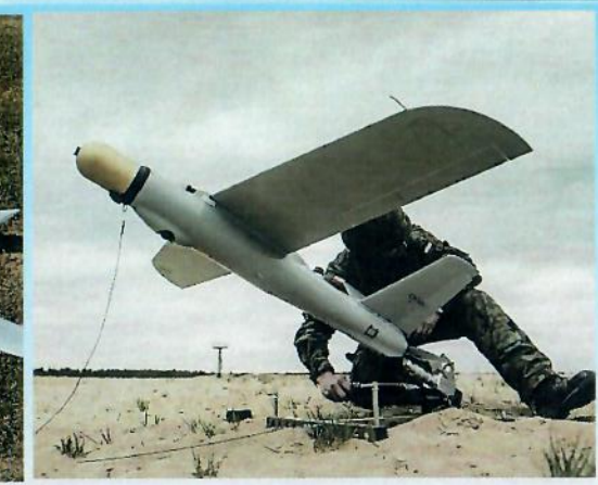
Layout of the unmanned aerial complex Warmate