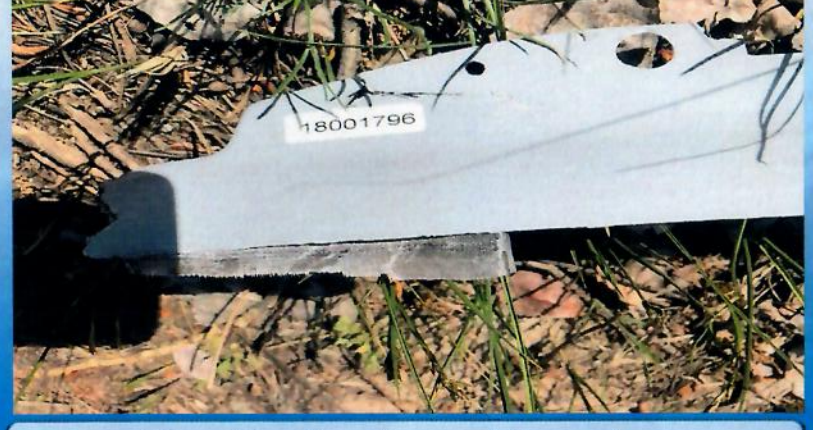
UAV shot down near Zaporozhskaya NPP