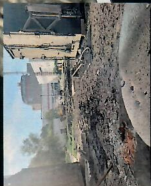
Damage to the auxiliary equipment of the hydroshop