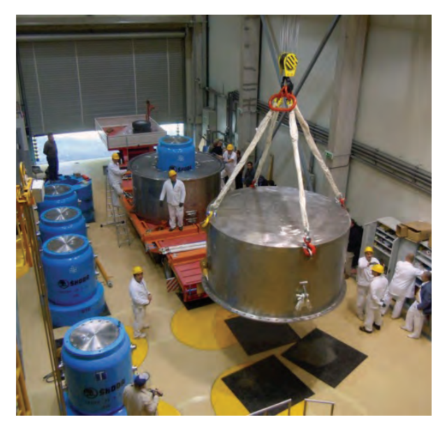
FIG. 2. Dual purpose casks (blue) procured by the Agency being loaded into TUK-145/C transport packages for the repatriation of spent HEU fuel at the KFKI Atomic Energy Research Institute research reactor site in Budapest.

lessons learned, will be incorporated into future projects to optimize their implementation.