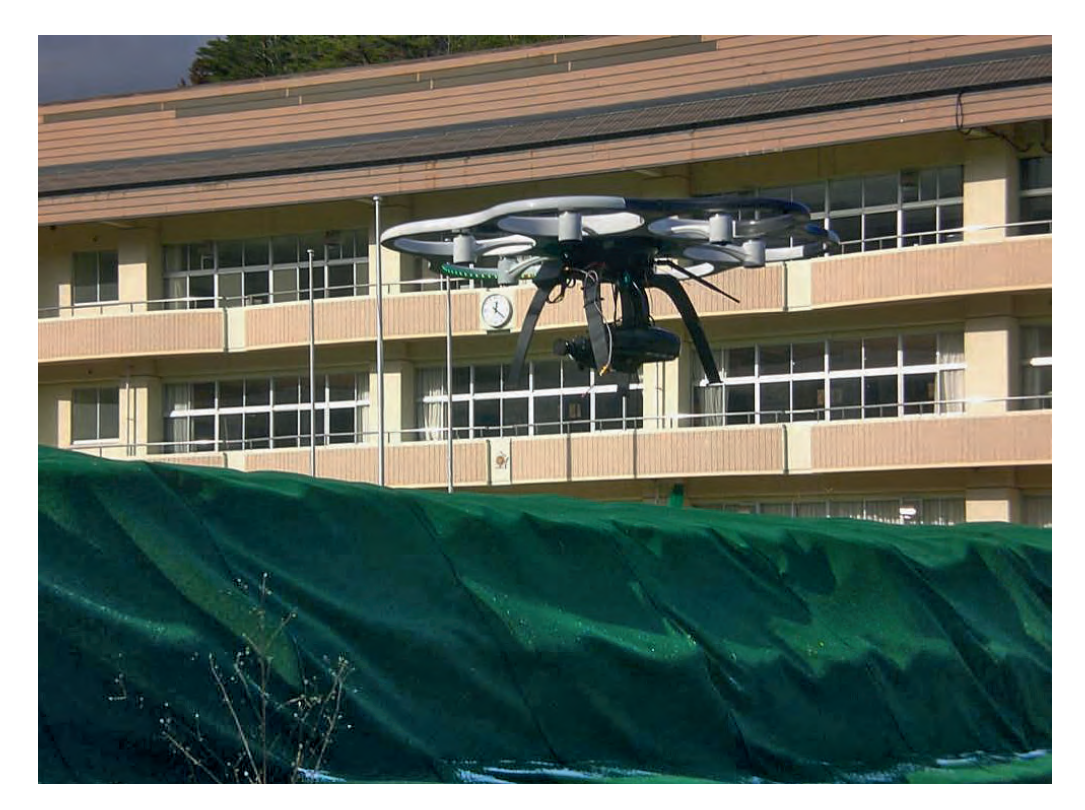
FIG. 3. An Aibotix X6 UAV hovering over a temporary storage site in Fukushima Prefecture in December.

and the Agency in the area of safeguards activities were identified. In addition, the meeting concluded that it will be necessary to clarify the framework for non-proliferation verification of fusion power systems.