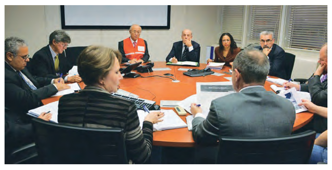
FIG. 3. The Director General (centre, wearing orange vest) and members of his senior management team at the ConvEx3 (2013) exercise.

The ConvEx-3 (2013) exercise, held in November and hosted by Morocco, was designed to allow Member States and international organizations to evaluate their response to a severe radiological emergency triggered by a nuclear security event and to identify EPR areas requiring improvement. Fifty-nine Member States, including Morocco, and ten international organizations, including the Agency, participated in the exercise, which lasted approximately 25 hours (Fig. 3). Twenty-four Member States and six international organizations tested their EPR arrangements and capability to respond to this type of event. The participation of relevant international organizations (including INTERPOL and Europol) contributed to the harmonized international response and the provision of consistent public information. Effective cooperation with the Moroccan Government in preparing, conducting and evaluating the exercise contributed to the improvement of emergency preparedness to respond to radiological emergencies worldwide.