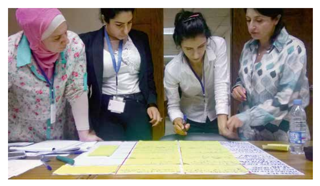
FIG. 3. Participants in a field monitoring mission to Beirut, Lebanon.

Also during the year, the Agency continued to review complementary monitoring instruments such as Project Progress Assessment Reports (PPARs), field monitoring missions (Fig. 3) and self-evaluations. These instruments provide a mechanism to identify and communicate lessons learned, and give a valuable snapshot of the status of completion of project outputs.