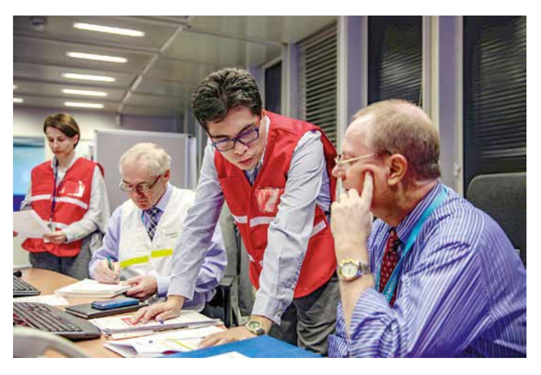
FIG. 2. Agency staff responders during an internal exercise in 2015.

The Agency conducted a comprehensive programme of training, drills and exercises in 2015 to enhance the skills and knowledge of Agency staff members who serve as qualified responders under the Incident and Emergency System (Fig. 2). The programme offered approximately 130 hours of training during the year, including 78 training classes delivered to over 170 Agency staff responders. The exercises were used to test various elements of the response arrangements, including the notification and exchange of official information, the provision of public information, and the assessment and prognosis process.