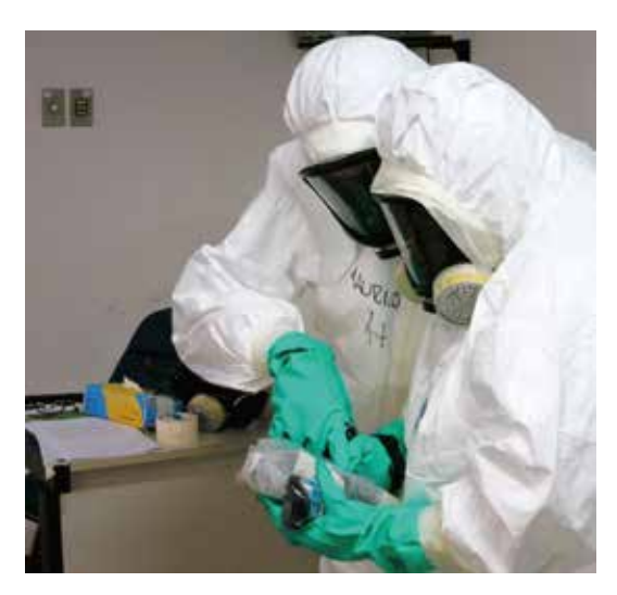
FIG. 3. Participants in the School of Radiation Emergency Management held in November at the CNEN's Institute of Radiation Protection and Dosimetry in Rio de Janeiro, Brazil.

In 2015, the Agency conducted 15 expert missions to Member States in Asia, Europe and Latin America on subjects ranging from supporting the establishment of radiation monitoring networks to assisting the national hazard assessment process. The missions were designed to help Member States enhance their national emergency arrangements. The Agency also initiated a project, in coordination with the European Union, to enhance emergency arrangements in member States of the Association of Southeast Asian Nations in order to build upon and optimize existing regional EPR capabilities, including the sharing of radiation monitoring data through IRMIS.