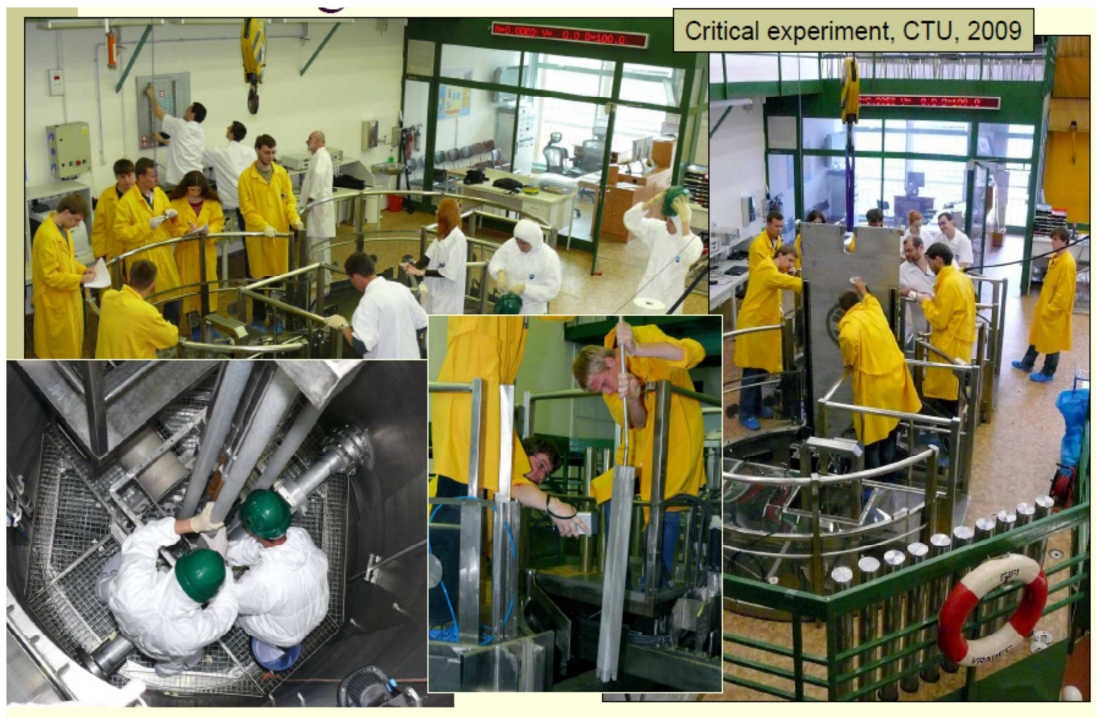
FIG.V-2: Training courses at the VR-1 training research reactor of the Czech Technical University (CTU) in Prague.

Research reactors are well suited to this role. Many have utilization programmes specifically developed for nuclear related training and education and are often very willing to accommodate the needs of other countries. Austria, for example, has no nuclear power programme, but the research reactor in Vienna is a founding member of the East European Research Reactor Initiative (EERRI) and supports the nuclear education and training programmes of other countries. These include training NPP operators from other countries. Another example is in Jordan, where the Jordan University of Science and Technology is using a web-based video system to permit its nuclear engineering students to complete exercises and experiments as if they were present in the control room of a research reactor at the North Carolina State University in the USA.