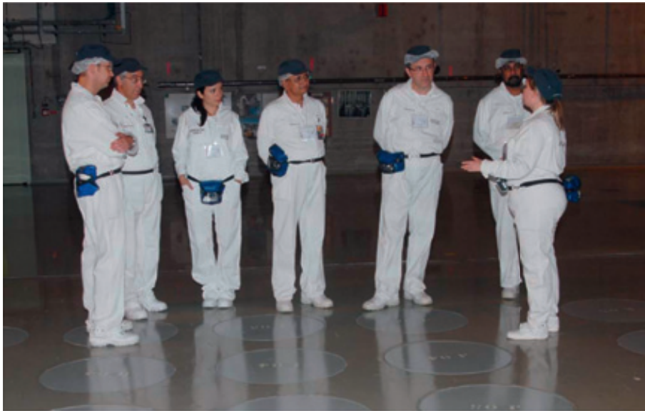
FIG. 3. NFCIS coordinators and nuclear fuel cycle experts discussing fuel cycle synergies and sustainability at the spent fuel reprocessing plant in La Hague, France.

Agency's Integrated Nuclear Fuel Cycle Information System (iNFCIS) ( http://www-nfcis.iaea.org/ ). In 2010, iNFCIS received more than 600 000 visits from about 12 000 registered users. The on-line information system includes the Nuclear Fuel Cycle Information System (NFCIS), World Distribution of Uranium Deposits (UDEPO), Post-Irradiation Examination Facilities Database (PIE) and Minor Actinide Property Database (MADB). In 2010, a new activity was initiated to collect information on the World Distribution of Thorium Deposits and Resources (ThDEPO).