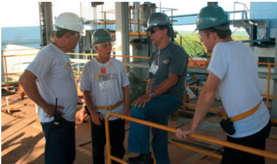
FIG. 1. UPSAT members interviewing staff at the Caetité uranium mine in Brazil.

The Agency was requested by Brazil to send a Uranium Production Site Appraisal Team (UPSAT) to undertake a peer review of operations at the uranium mine at Caetité (Fig. 1). UPSAT peer reviews may be requested by any Member State for any part of their uranium production cycle operations. The UPSAT mission to Caetité took place in February. The team comprised five experts — from Australia, Canada, the Czech Republic, France and the Agency — who