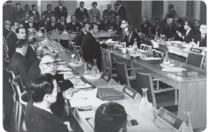
First meeting in Vienna of the Board of Governors of the IAEA