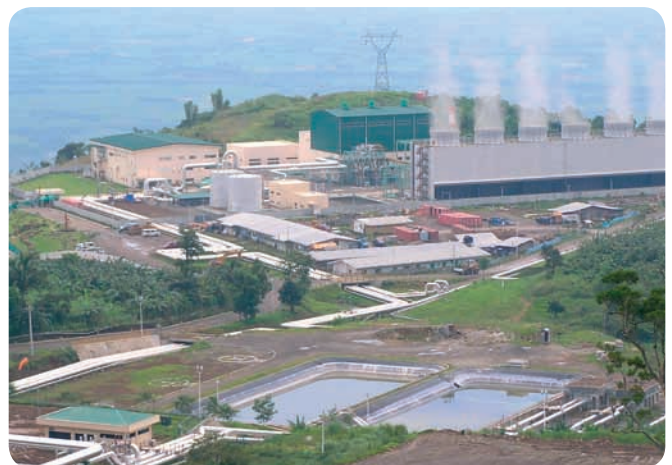
Northern Negros Geothermal Power Plants

Almost every aspect of development — from poverty reduction to the improvement of health care — requires reliable access to modern energy services. IAEA helps developing countries by providing support to national institutions in comprehensive energy planning. This may also include consideration of the nuclear option. The IAEA offers a broad range of programmes to countries that are interested in making nuclear power part of their sustainable development strategies.