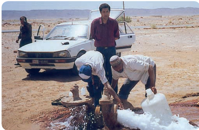
Collecting water samples for isotope measurements, Morocco

Isotope hydrology allows us to identify the characteristics of water, and thereby to determine its source, pathway and rate of recharge. Isotope hydrology helps Member States to understand the water cycle and thus to manage their scarce water resources. Currently, over eighty water projects deal with transboundary aquifers, groundwater and surface water resources in Africa, Asia and the Pacific, Europe and Latin America