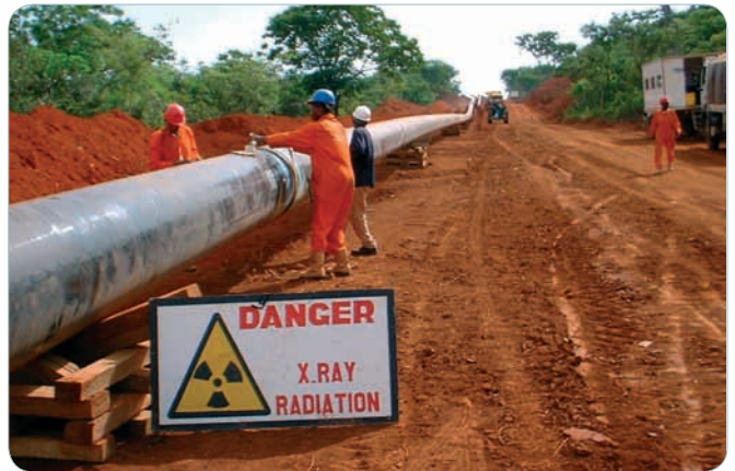
Non-destructive testing, Chad-Cameroon oil pipeline

Nuclear technology can save lives, protect the environment and advance economic development. The IAEA contributes to supporting national analytical laboratories, and developing capacities to certify and regulate applications in industry, medicine and agriculture that use nuclear science and technology. This is particularly important to developing countries entering the global market. Projects include radiopharmaceutical production, radioanalytical services, industrial methodologies such as non-destructive testing, and environmental applications including flue gas scrubbing and effluent cleanup in industrial installations.