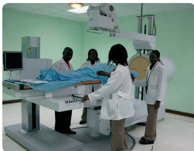
Zambia Radiotherapy Centre

IAEA technical cooperation activities in human health include developing and evaluating nutritional interventions to combat malnutrition, assessing the immune responses of individuals infected by various diseases, and monitoring the emergence of drug resistance. Other areas of focus include nuclear medicine and cardiology. The IAEA also provides low and middle-income countries with radiation technology and training to improve cancer management. The IAEA’s Programme of Action for Cancer Therapy (PACT) helps developing countries build sustainable programmes for comprehensive cancer control.