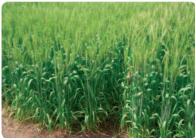
Improved wheat variety, Kenya

IAEA environmental activities focus on the sustainable use and management of natural resources, and on using nuclear technologies to understand and protect marine and terrestrial environments. By training scientists and sharing expertise, the IAEA helps to monitor pollutants, measure changes and mitigate damage, and assists Member States in managing sensitive areas such as their coastal zones.