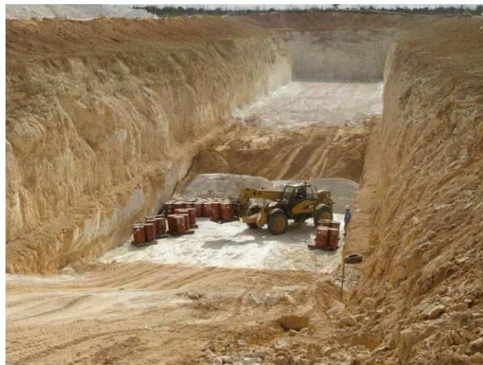
Figure 4 The Mt Walton East Intractable Waste Disposal Facility in Western Australia

The disposal of radioactive wastes at the Mt Walton East IWDF in Western Australia (Figure 4) has been regulated by the radiation regulator since 1992. The site was chosen based on criteria in the IAEA publication, Site Investigation for Repositories for Solid Radioactive Waste in Shallow Ground, Technical Report Series No. 216 (1982). All aspects of the design, operational requirements, duties and responsibilities must comply with the Western Australian legislation and the near-surface disposal code (NHMRC, 1992). Work is currently underway to transition to requiring compliance with RPS C-3 which has replaced the Code of practice for the near-surface disposal of radioactive waste in Australia (1992) (NHMRC 1992). Radiation monitoring at the disposal facility is carried out in accordance with documented requirements given by the regulator. Measurements include absorbed dose rates in air, radon concentration in air, radionuclide concentrations in water, and pre- and post- disposal measurements. Personnel monitoring is carried out during a disposal campaign.