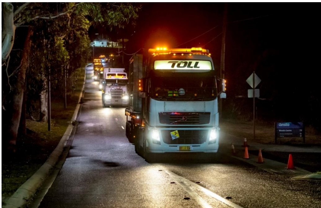
Figure 3 Transport of used OPAL reactor spent fuel (2018)