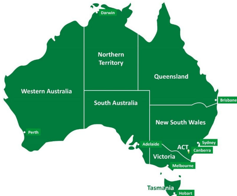
Figure 1 Map of Australia showing states and territories

Australia is a federation of nine jurisdictions (