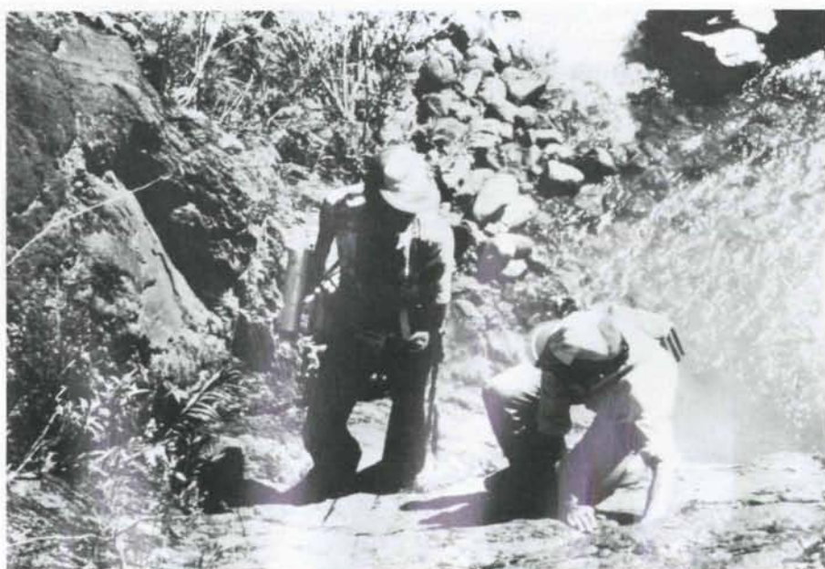
Part of a geochemical and radiometric survey in Colombia. Local geologists benefited from on-the-job training while carrying out the survey under the supervision of an IAEA expert.

However, in coal production and utilization plants, neutron activation analysers are preferred because coal