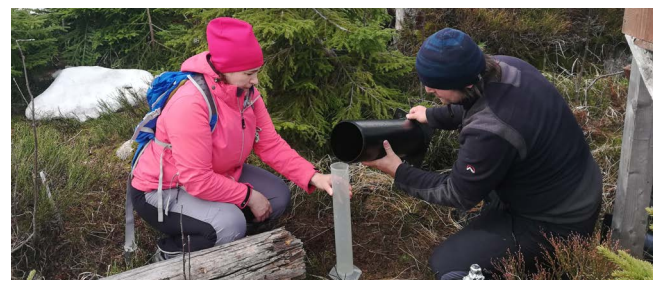
Sampling for the Nitrate Case Study in the Czech Republic.

The opportunity Nitrate (NO 3 ) has emerged as a widespread and highly discussed groundwater contaminant across Europe, while drinking water sources exceeding permissible limits of nitrate concentrations are a frequently reported and alarming phenomenon. Intensified agricultural practices and fertilizer applications, along with other anthropogenic activities, are assumed to be the primary sources that have produced these high accumulations of nitrate in surface and groundwater reservoirs.