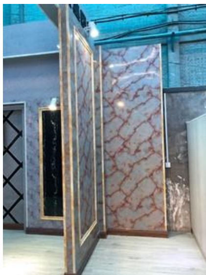
Phosphor gypsum applied in ceramic panels