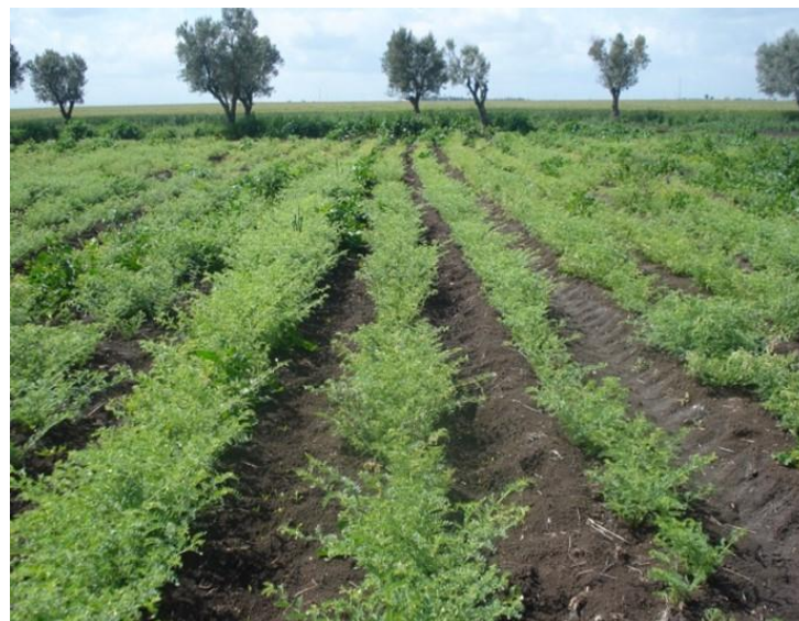
Winter chick pea, grown on Phosphor gypsum fertilizer