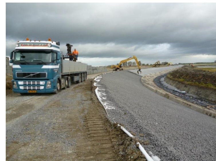
Slag from thermal phosphorus production applied in dyke construction