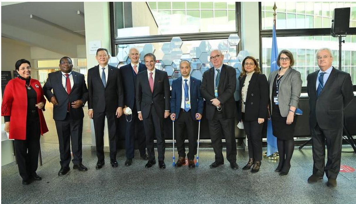
New donor representatives join DG Grossi for a group photo at the 25 November ReNuAL2 Side Event.

Public recognition of donors is an important way to express gratitude to those who make the modernization of the laboratories possible. At a General Conference side event in September 2021, the Director General unveiled a new donor recognition display to honor contributors to the ReNuAL2 phase of the modernization initiative. The display currently includes plaques bearing the name and flag of 20 Member States that have announced contributions to date, with future contributors to be added at upcoming events. The display will be permanently installed in the lobby of the new laboratory building in Seibersdorf upon its completion. In the interim, the display can be viewed on the ground floor corridor of the A building in the Vienna International Centre.