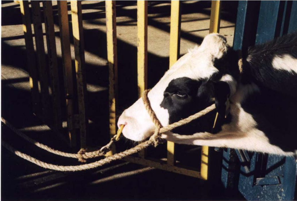
Fig. 2: Young bulls should be taught to lead with the halter. The nose ring is used sparingly for restraint and not at all when the bull is immediately behind the teaser.

delivered via the nose ring, which could lead to low libido (e.g. many of the difficult, slow, low libido Bos indicus bulls may have been made that way by poor training and handling techniques).