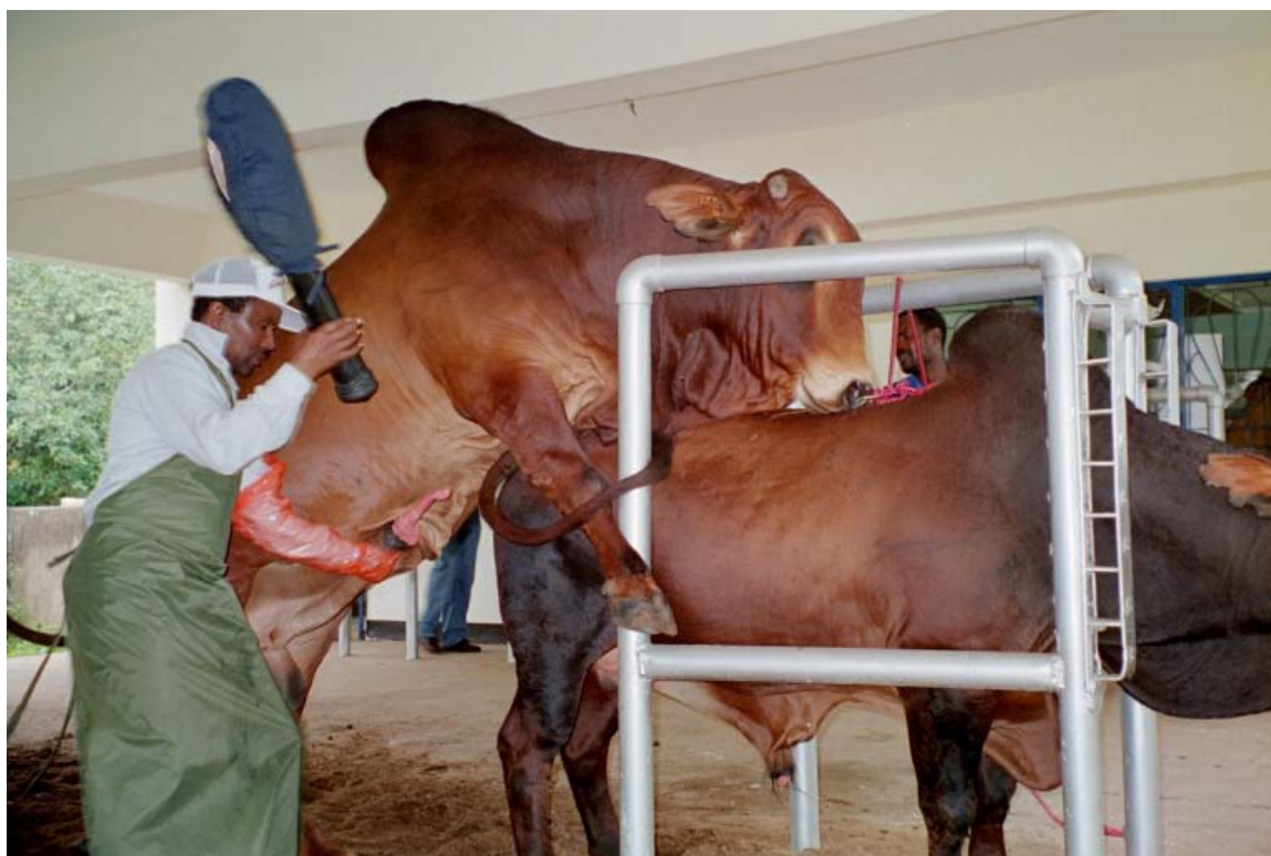
Fig. 7: Collection of semen with the artificial vagina. The left hand touches only the preputial skin, not the penis itself.

The ejaculate should be taken immediately to the evaluation room. Handling of semen should be always done with great care to avoid cold shock, contamination, excessive agitation and direct sunlight.