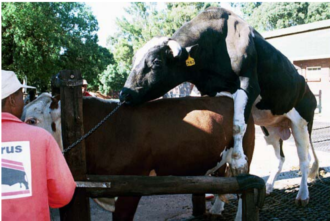
Fig. 6: Sexual preparation assists in improving the bull's serving behaviour at collection. It helps to obtain more spermatozoa in the collected ejaculate. The bull at the top is a slow server and is being given a false mount in a different environment to the collecting area

Bulls should be lead to the teaser in a gentle friendly manner by the handler paying attention to the temperament of the particular bull, preferably using a halter. The bull should be allowed to watch other bulls mounting before collection. He is lead around behind the teaser and may be allowed to mount other bulls. Two false mounts are given (Fig. 6). These measures constitute good sexual preparation which increase sexual excitement and the amount of semen collected. The bull is then allowed to mount for the first collection.