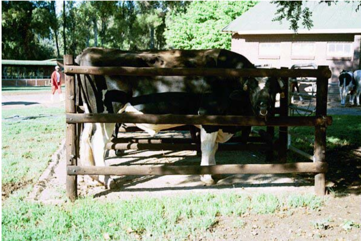
Fig. 4: Holding facilities for bulls in South Africa.