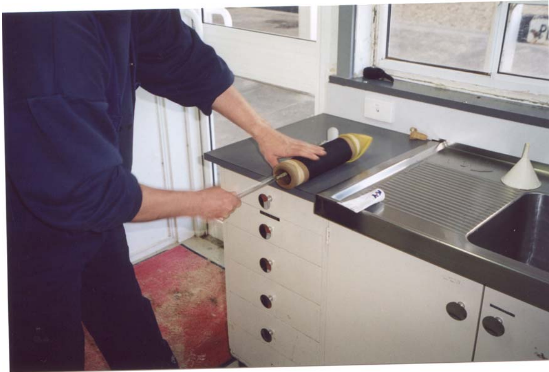
Fig. 5: Preparation of the artificial vagina; lubricating with a glass rod using KY jelly.

Sterile and non-spermatotoxic lubricant (eg. KY jelly, which has been tested and found to be non-toxic in diluted form) should be applied sparingly and just before collection (Fig. 5). The lubricant can be replaced by a small amount of diluent to moisten the entrance to the artificial vagina.