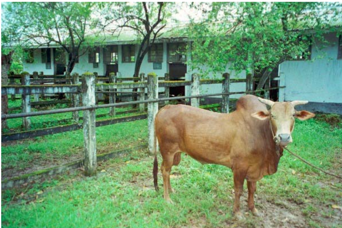
Fig. 1: An indigenous bull in the tropics at an AI station. His genetic worth for the local small holder farmer needs to be defined. Note cool housing.

These cornerstones are the same for the improvement of indigenous breeds, exotic breeds, cross breeding and the formation of synthetic breeds.