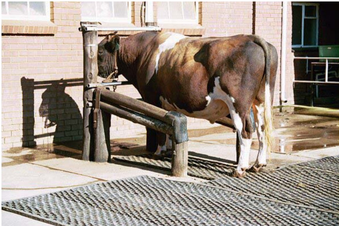
Fig. 3: Strong timber construction of stanchion for teaser bull restraint in South Africa. Note the non-slip floor.

Facilities for the restraint of bulls awaiting their turn for semen collection should be near enough to enable them to see clearly the mounting bull and serving area (Fig. 4). The collection area should be ringed with strong metal bars or timber for the safety of people and the bulls themselves. The construction should be high enough to protect the full height of an average person (1.75 m). Spaces between rails should be small enough to prevent a bull getting his head through. Escape spaces in the surrounding fences should be placed at regular intervals. The collection area should be sheltered and must have adequate ventilation and light.