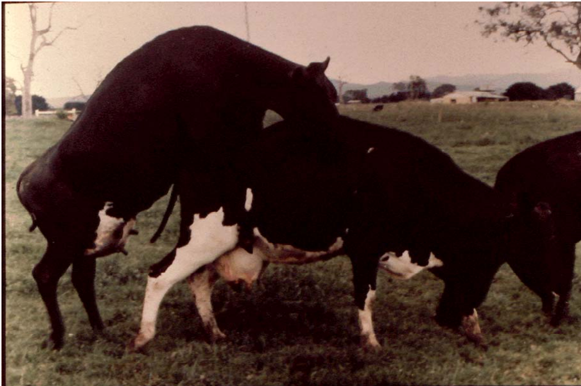
Fig. 9: The cow in oestrus stands to be mounted.

Ideally, if a cow is first seen in heat in the morning, she should be inseminated in the afternoon of the same day and if she is first seen in heat in the afternoon or evening, she should be inseminated the next morning. This well documented rule has recently been questioned. Good conception rates are being obtained with a once per day service. The