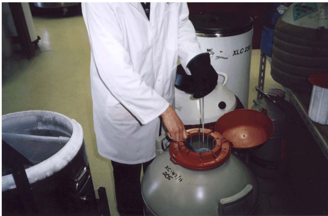
Fig. 10: When transferring frozen straws the canister should not be brought beyond the neck of the container. It should not remain there for more than ten seconds.

Transferring of semen from the tank to the thawing water must be done quickly. Canisters should remain in the neck of the tank (Fig. 10) less than 10 seconds and preferably no longer than 5 seconds. Frequent opening of semen containers is to be discouraged (not more than 10 seconds in any 10 minute period).