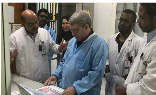
An assessment of the Central Food Laboratory at the Qatar Ministry of Public Health is conducted by the US accreditation organization ANAB to prepare for the ISO 17025 certification of its technical competencies in determining gamma ray emitting radionuclides. The IAEA supported training and procurement of equipment for the laboratory.

The IAEA's technical cooperation (TC) programme helps countries to use nuclear science and technology to address key development priorities in areas including health, agriculture, water, the environment and industry. The programme also helps countries to identify and meet future energy needs. It supports greater radiation safety and nuclear security, and provides legislative assistance.