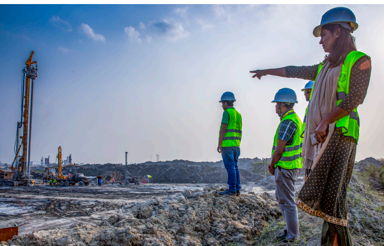
Construction of the nuclear power plant at Rooppur in Bangladesh. The IAEA assisted the country with legal and expert advice on the plant's development as well as on the development of a radioactive waste management system. Upon completion, the power plant will generate 2400 megawatts of electricity.

The IAEA's technical cooperation (TC) programme helps countries to use nuclear science and technology to address key development priorities in areas including health, agriculture, water, the environment and industry. The programme also helps countries to identify and meet future energy needs. It supports greater radiation safety and nuclear security, and provides legislative assistance.