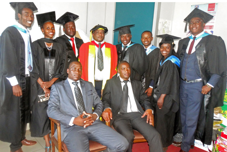
MSc graduates of the first medical physics course at the National University of Science and Technology

In recent years, IAEA support focused on developing drought tolerant varieties of legumes, improving soil and water management, monitoring livestock diseases, strengthening laboratory capacity for food safety, and controlling tsetse flies. In human health, efforts focused on re-establishing and consolidating radiotherapy and nuclear medicine services in Harare and Bulawayo. Support was also provided to strengthen the national regulatory infrastructure, particularly in the area of public exposure control.