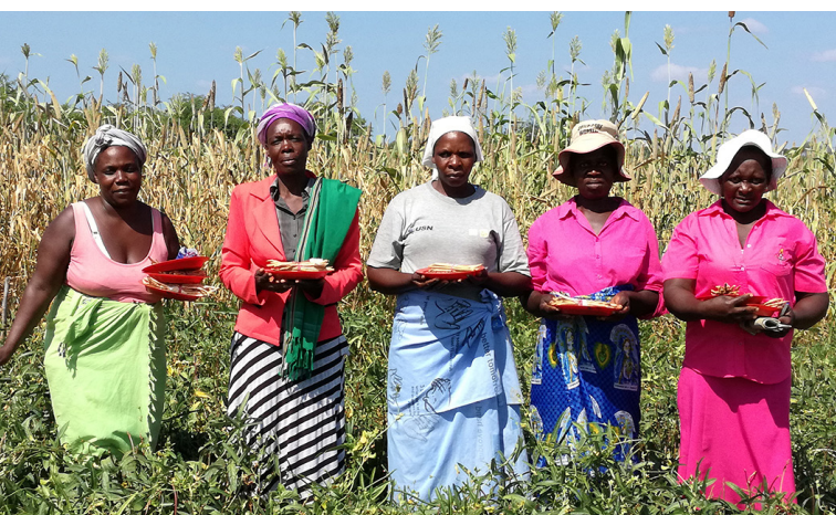
Cowpea farmers harvesting a new cowpea mutant variety (CBC5) in Matabeleland South, Zimbabwe. The variety was developed using nuclear techniques.

The IAEA's technical cooperation programme helps countries to use nuclear science and technology to address key development priorities, including health, agriculture, water, the environment and industry. The programme also helps countries to identify and meet future energy needs. It supports greater radiation safety and nuclear security, and provides legislative assistance.