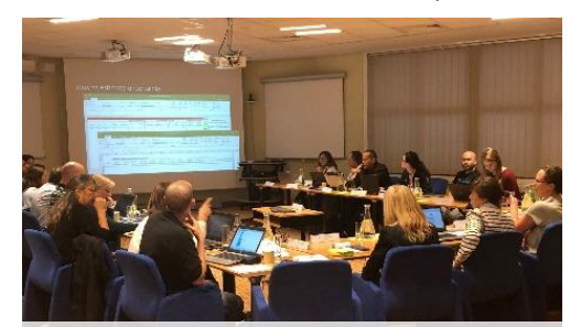
Workshop participants engaged in lectures, discussions, and hands-on sessions

included participation from 15 scientists representing 15 countries from different regions around the world. Different data products and resources were presented, such as the GOA-ON data portal, SOCAT, GLODAP and the OA-ICC compilation of biological response data and bibliographic database.