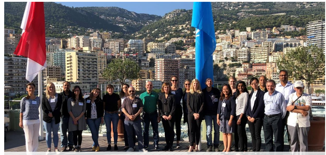
Participants of the advanced ocean acidification data management & analysis workshop at the IAEA Environment Laboratories, Monaco

The latest news and updates from the OA-ICC and partners