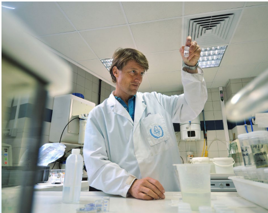
Technical Officers (TOs)