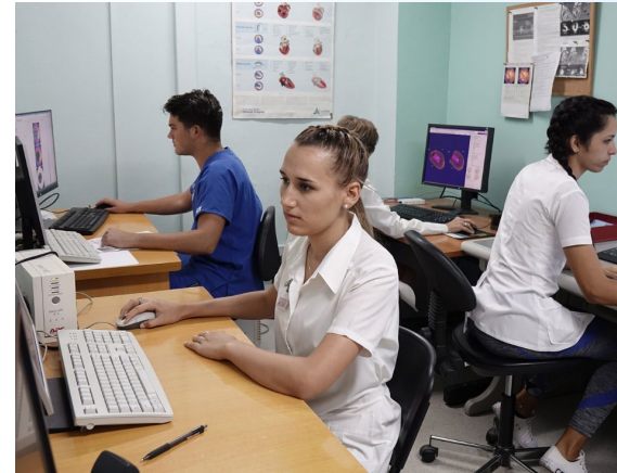
NLOs and National Counterparts