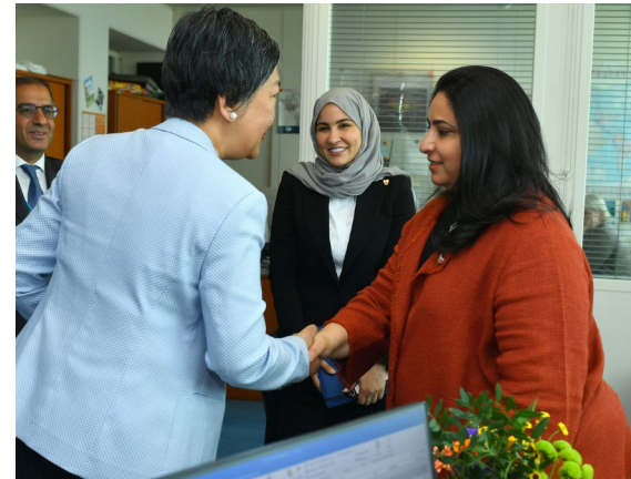
Programme Management Officers (PMOs)