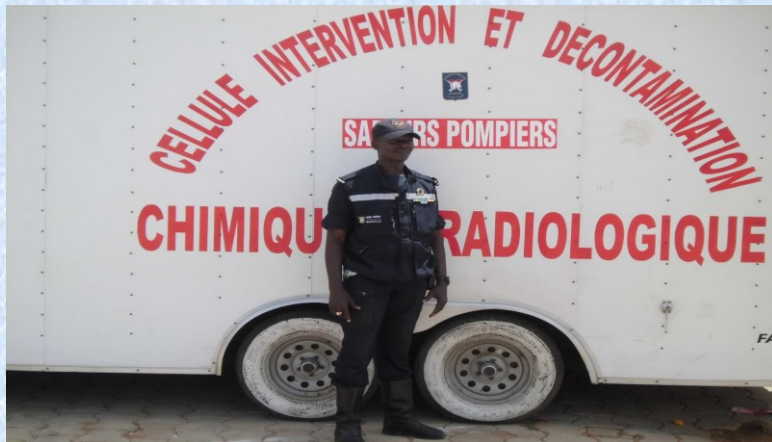
Fire Brigade CBRN Unit Training