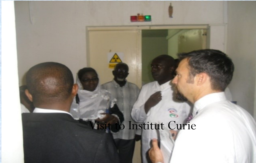
Visit to Institut Curie