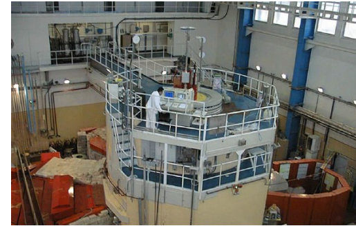
Budapest Research Reactor