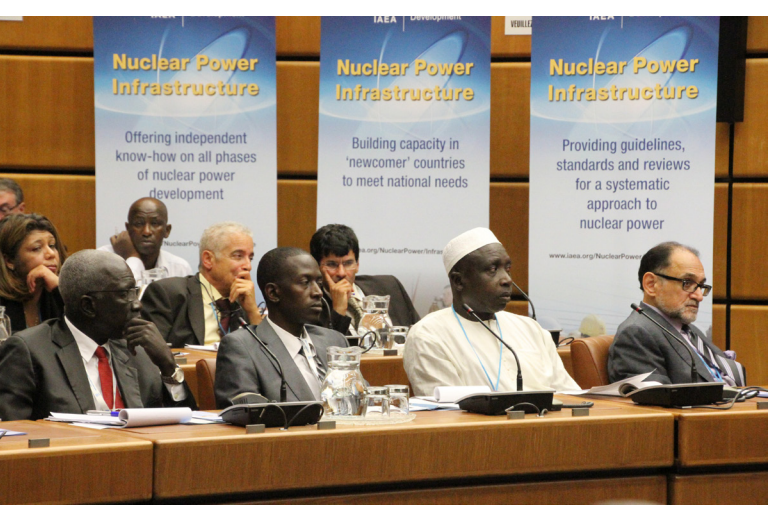
About 30 countries, mostly from the developing world, are interested in adding nuclear power to their energy mix.

The IAEA provides assistance and information to countries that want to introduce nuclear power. It helps interested Member States to develop their energy planning capabilities and establish the necessary infrastructure for a safe, secure and sustainable nuclear power programme.