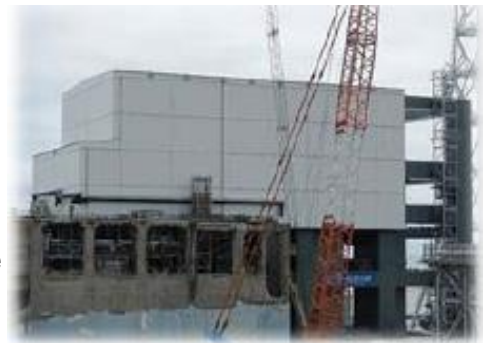
Figure 2: Unit 4 with a cover for fuel removal installed