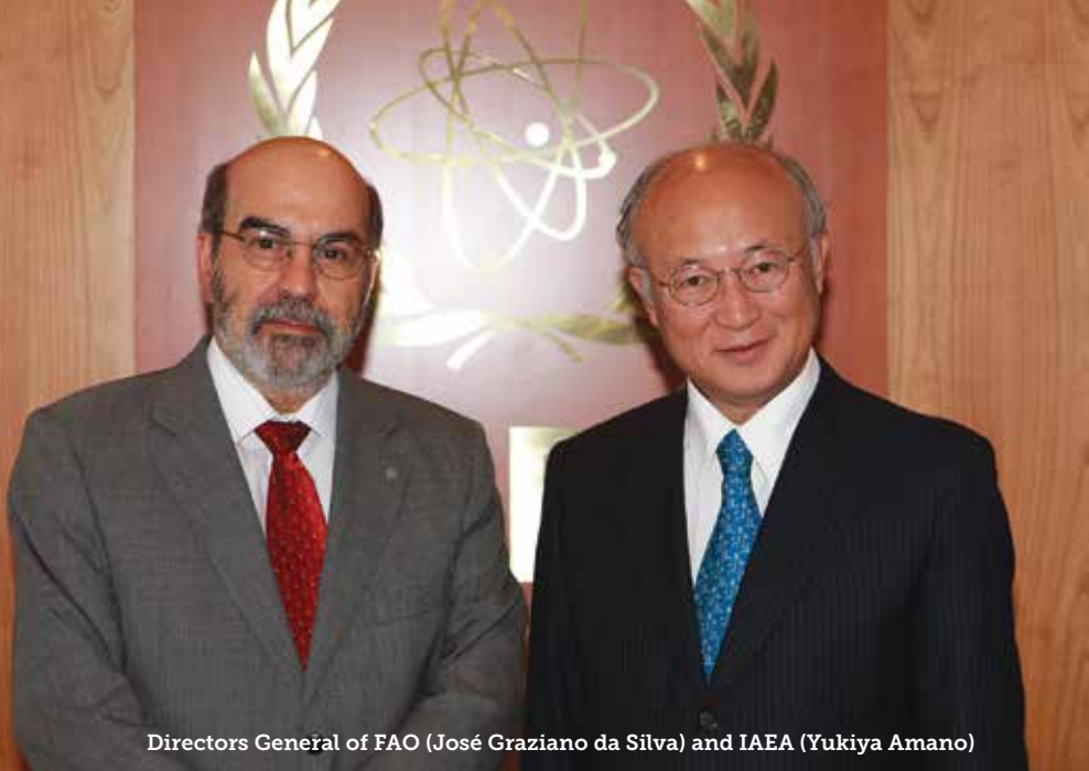
Directors General of FAO (José Graziano da Silva) and IAEA (Yukiya Amano)