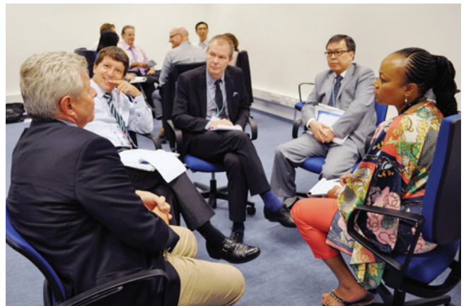
ISCA workshop, Vienna, Austria