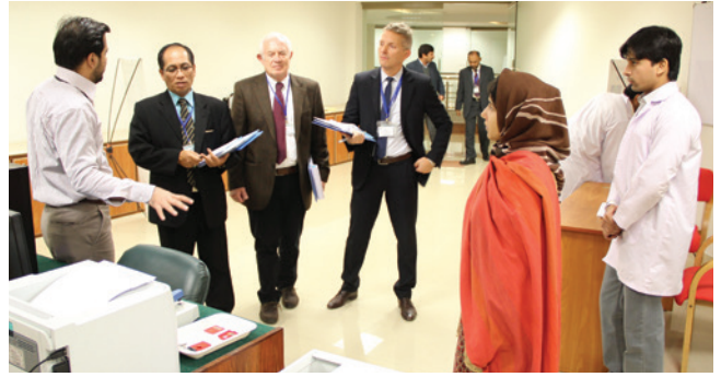
Preparatory EduTA, Pakistan

Final report: two months after the mission.