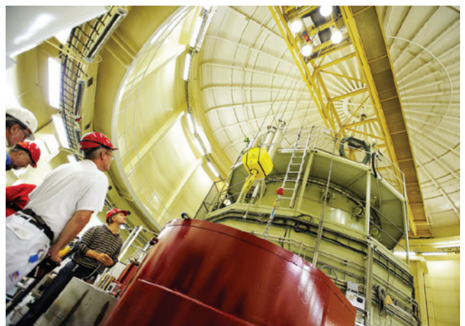
Inside of the JEEP II reactor at the Kjeller research centre, Norway