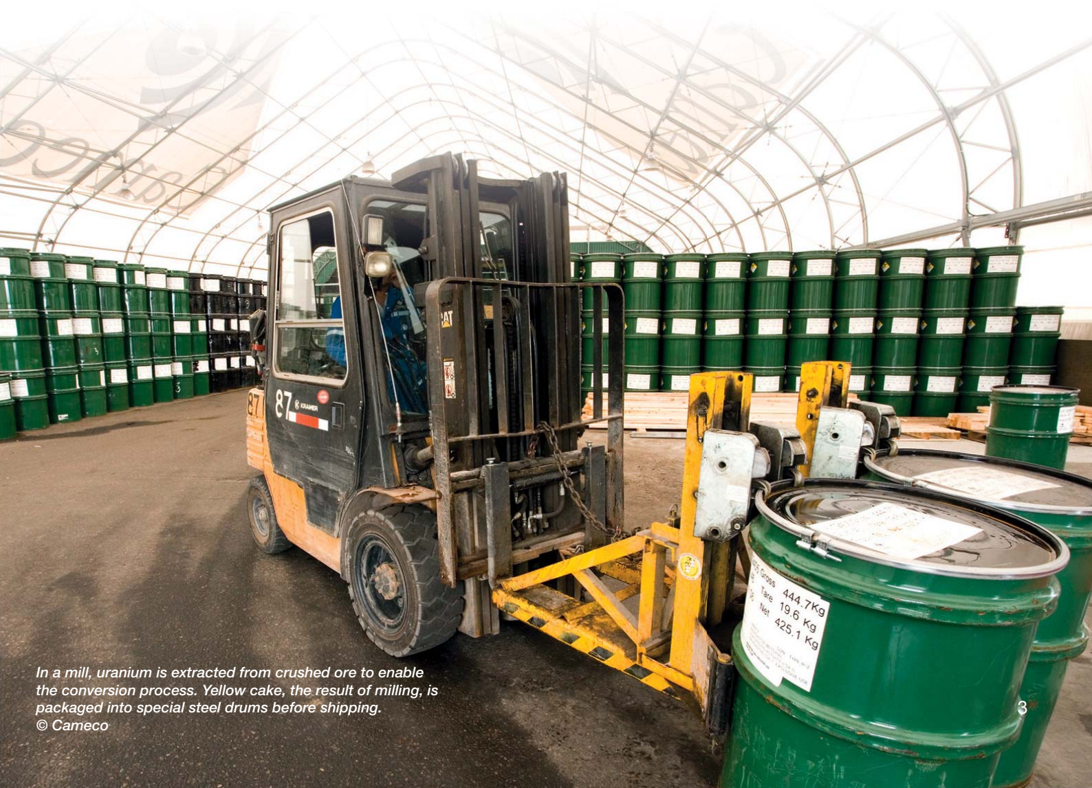
In a mill, uranium is extracted from crushed ore to enable the conversion process. Yellow cake, the result of milling, is packaged into special steel drums before shipping.

Uranium is a common, slightly radioactive material that occurs naturally in the Earth's crust.