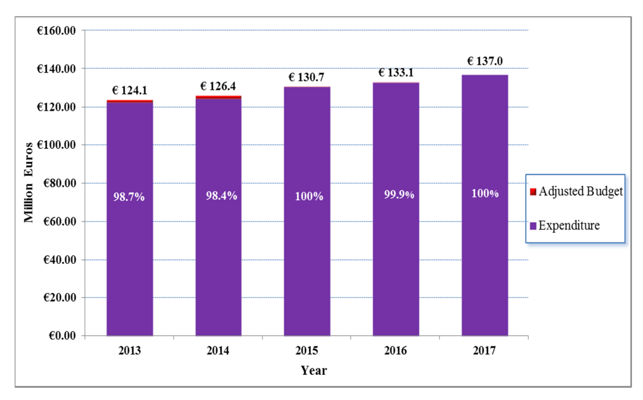
Figure 2. Major Programme 4 — Nuclear Verification — budget and expenditures, 2013–2017

54. The expenditures<sup>25</sup> from the extrabudgetary contributions were \in 26.8 ( \in 29.8) million, a decrease of 10.1% compared with 2016.